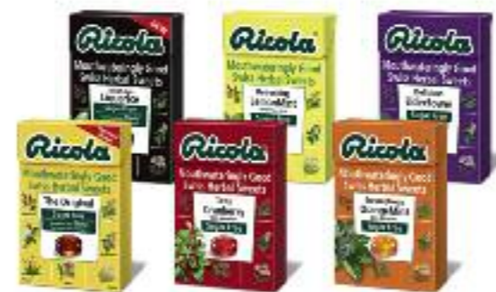
Above right: Cruising Lake Lucerne is a relaxing affair. Main and above: One of Ricola's show herb gardens on top of the mountain at Klewenalp and, below, Ricola's range of herb drops

It is hard to better Lucerne with its history, music and art, and the mountains and lake just a short boat ride away – the very best of Switzerland.