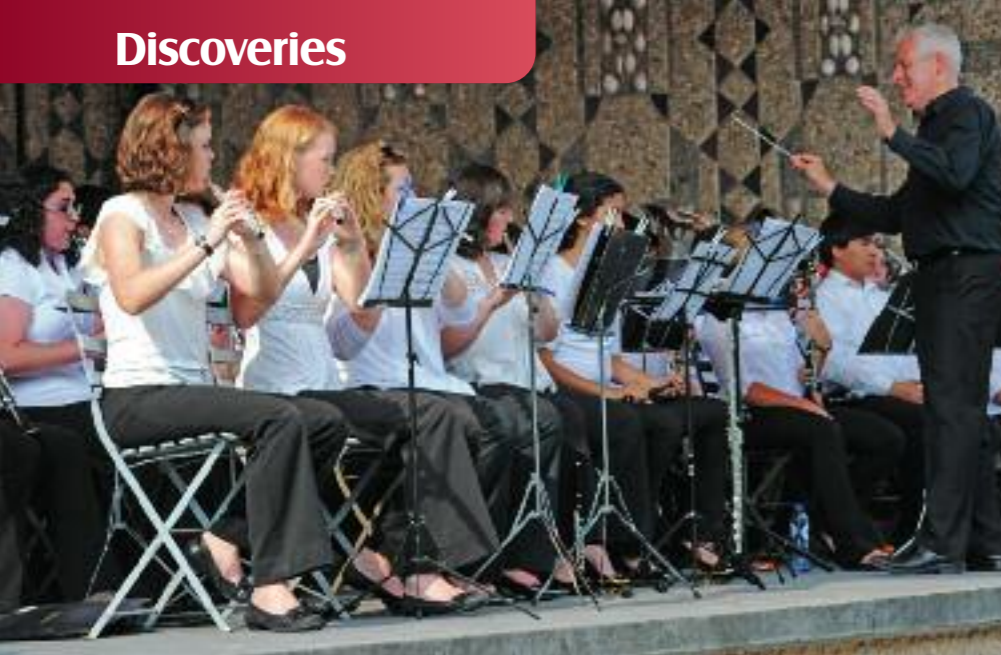
A spectacular cable care ride up to Klewenalp Left: Lucerne is noted for its classical music festival Middle: Teatime on the dock in Lucerne Below right: The archetypal image of Switzerland, a cow grazing in a mountain meadow Below left: Charming statue in the old town