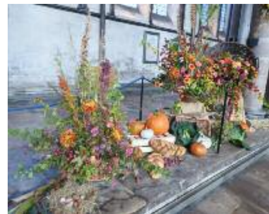
A harvest display in Salisbury Cathedral

Heath lived at Arundells, a beautiful old home in Cathedral Close, from 1985 until his death in 2005. The house is now open to group visits and the tour reveals Heath's true character as charming, witty, warm and kind. Our guide, a former