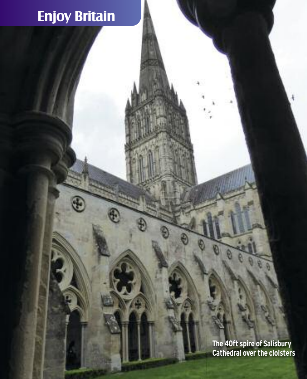
The 40ft spire of Salisbury Cathedral over the cloisters

cathedral with the 800th anniversary of the signing of the Magna Carta. The cathedral has one of the four remaining original manuscripts of the charter. The others are at the British Museum and Lincoln Cathedral.