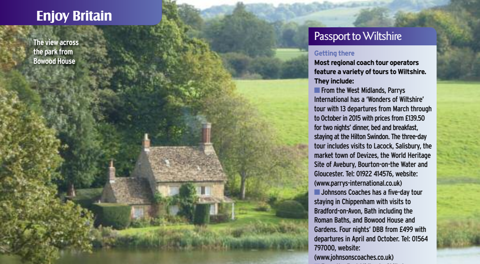
The view across the park from Bowood House