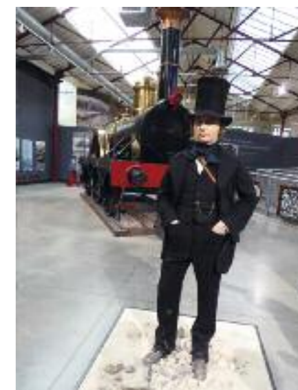
Isambard Kingdom Brunel at STEAM

The loss of both the owner of and heir to Stonehenge led in part to the monument being put up for sale at auction in 1915. Although there were calls for the nation to buy Stonehenge, it was Cecil Chubb, a locally born barrister,