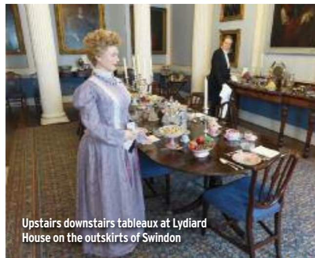
Upstairs downstairs tableaux at Lydiard House on the outskirts of Swindon

Only traffic on the nearby A303 reminds you of which century you occupy, and that may be gone soon if plans to divert it out of sight through a tunnel are completed. After taking my