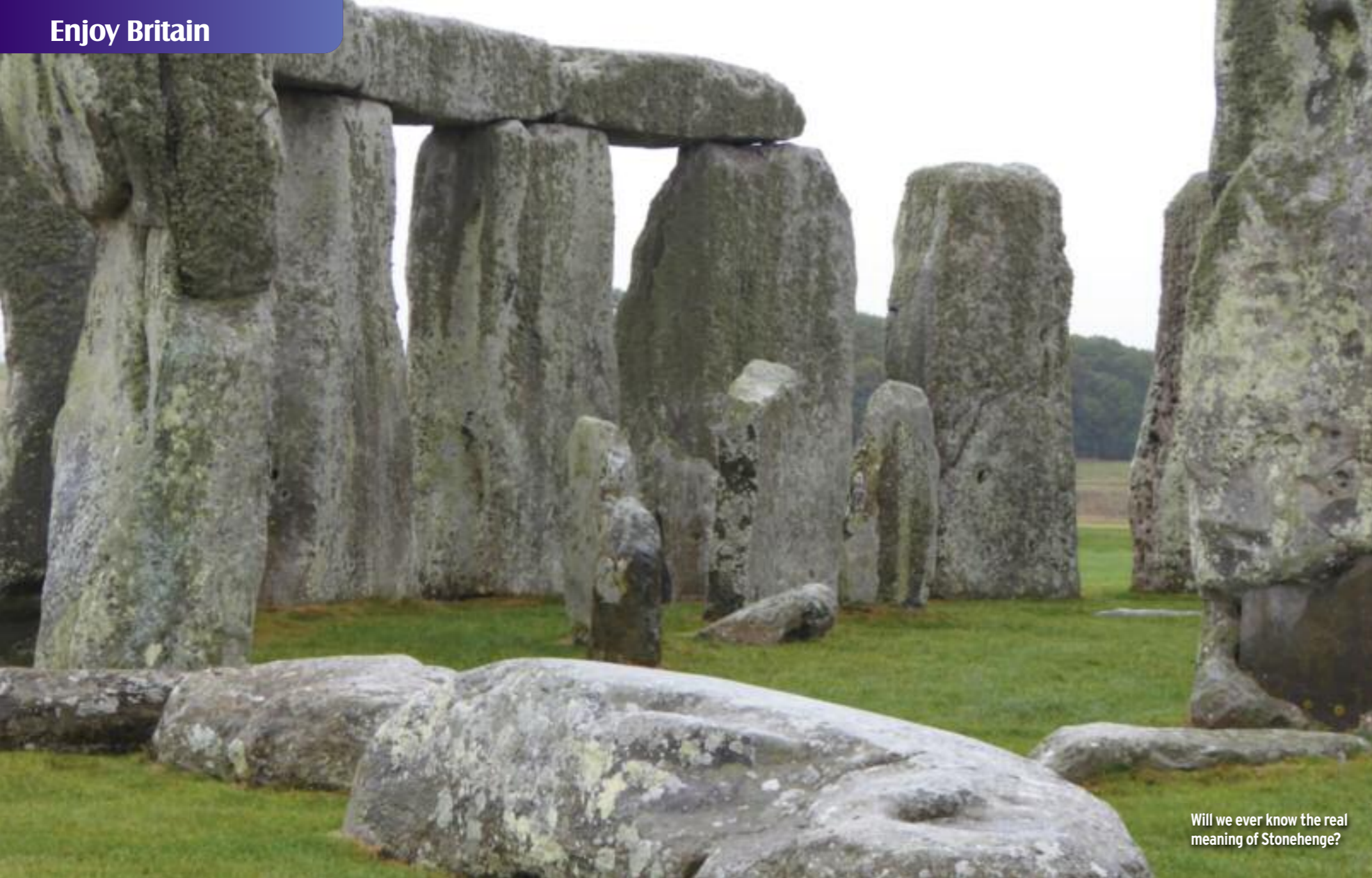
Will we ever know the real meaning of Stonehenge?

IT WAS a grey, overcast morning on Salisbury Plain and patchy rain drifted across the rolling landscape, but the moody day only heightened the mysterious shapes of Stonehenge.