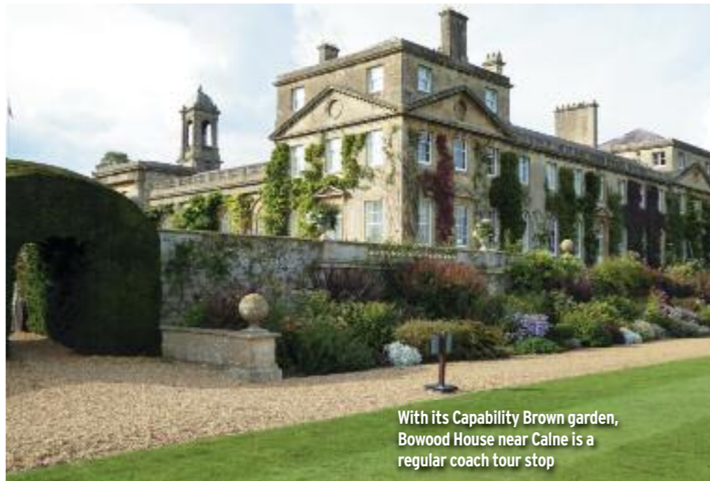
With its Capability Brown garden, Bowood House near Calne is a regular coach tour stop

This is a big year for Salisbury and the