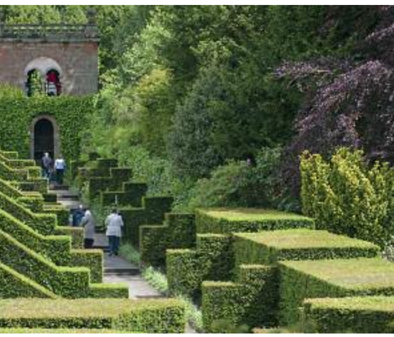
Visitors enjoying the Dahlia Walk at Biddulph Grange Garden, Staffordshire

Enjoy a satisfying stroll at Sizergh this summer, an unexpected treasure nestled on the edge of the Lake District. This muchloved family home stands proud in its natural setting. Explore the grounds where you will find the formal Dutch garden and the magnificent limestone rock garden. Admire the views and the tulips that border the terrace walls and take a walk to the beautiful kitchen gardens and orchard.