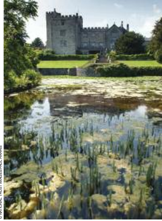
The lake at Sizergh Castle, Cumbria

* Website: (www.nationaltrust.org.uk/ claremont-landscape-garden/),