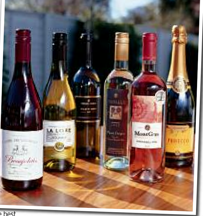
Waitrose has a great selection of summer wines

2013, Grenache, Syrah, Cinsault, £8.99, Waitrose