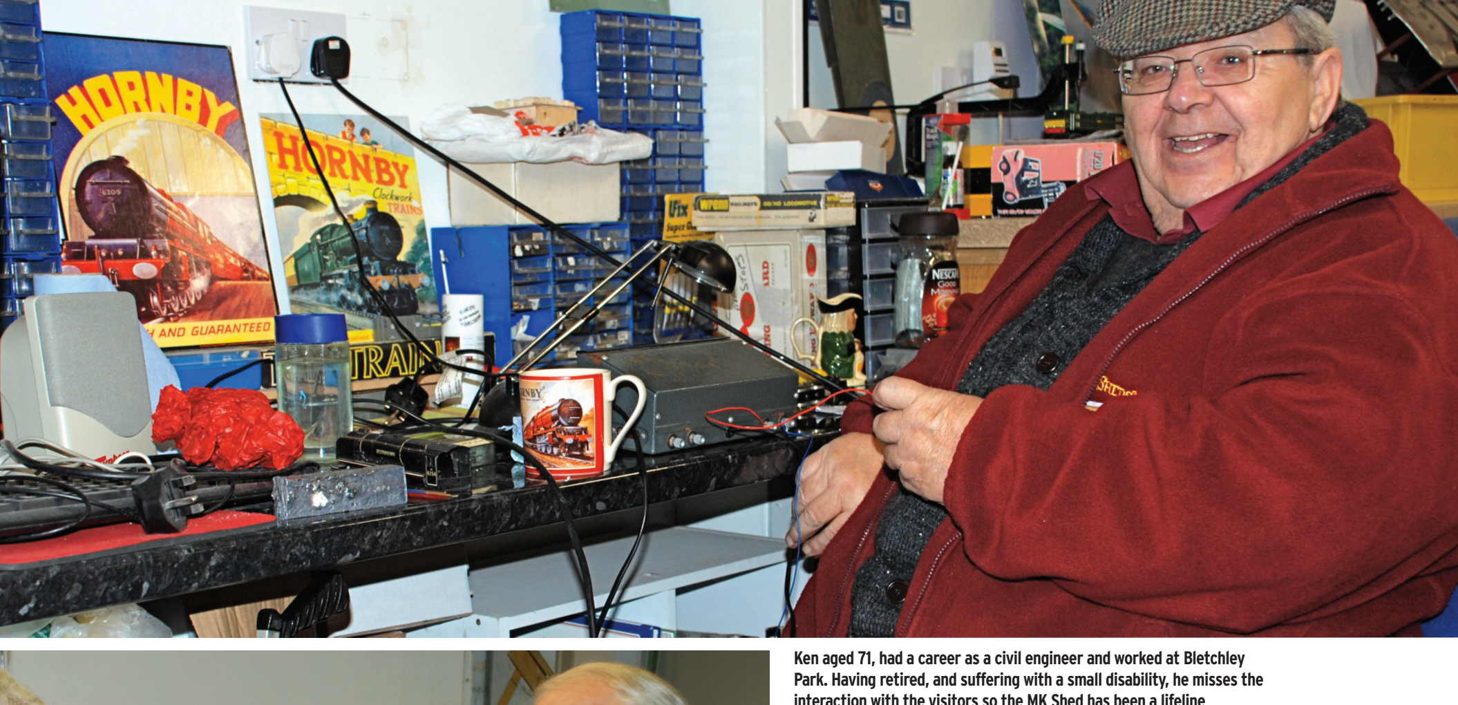
interaction with the visitors so the MK Shed has been a lifeline

occasional peaking at a headcount of around 80, there is still much to achieve.